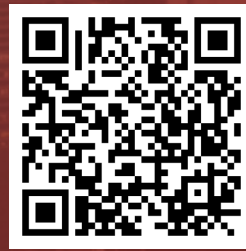
WJIF 2026 REGISTRATION