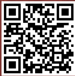
ISI OFFICIAL WEBSITE

Please scan the following QR codes to stay connected with us and receive the latest updates.