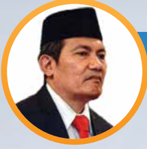
Saut Situmorang Former Deputy Head, Indonesia Anti-Corruption Commission (KPK)