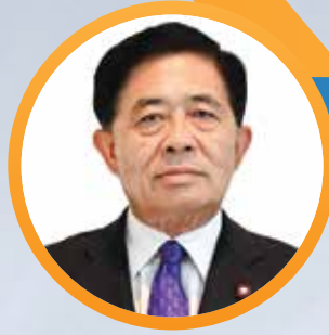
Nattachak Pattamasingsh Na Ayuthaya Commissioner, National Anti-Corruption Commission (NACC) Thailand